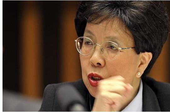
d. Margaret Chan