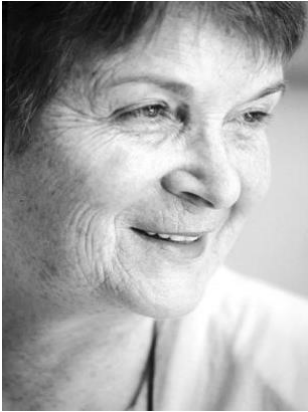
c. Türkan Saylan