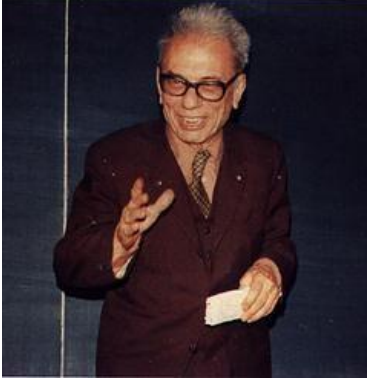
a. Cahit Arf

1. In what fields have these people been successful?